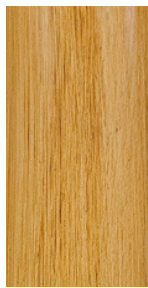
Natural Clear Coat finish