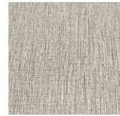
Light Moss upholstery